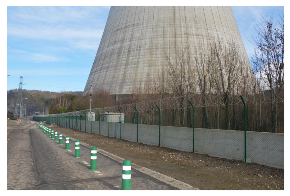
Figure 2: Peripheral protection of the site of Tihange against beyond-design flooding realized in 2015

The second flooding provision aims to protect the site either in case of a flood beyond-design, or in case of a failure of the peripheral protection in protecting the site against a flood below or equal to its design value. This second level of protections consists of non-conventional means that can be deployed during the flooding alert period. These non-conventional means are kept at least 1 m above the level corresponding to the design flood and consist of: