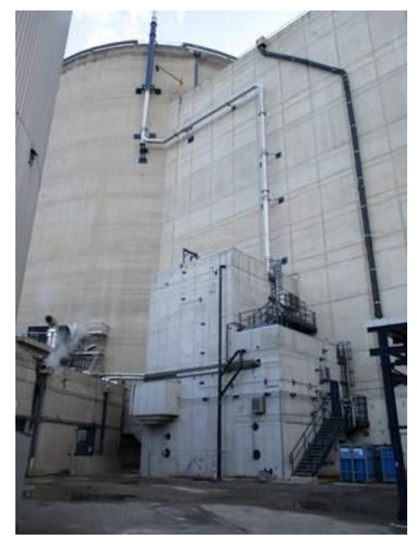
Figure 4 : Filtered containment venting systems of Tihange 3

Filtered containment venting systems have been installed on each unit and made operational by the end of 2017 (except for Doel 1 and 2, where the FCVS project is integrated in the LTO action plan and must be made operational by 2018-2019).