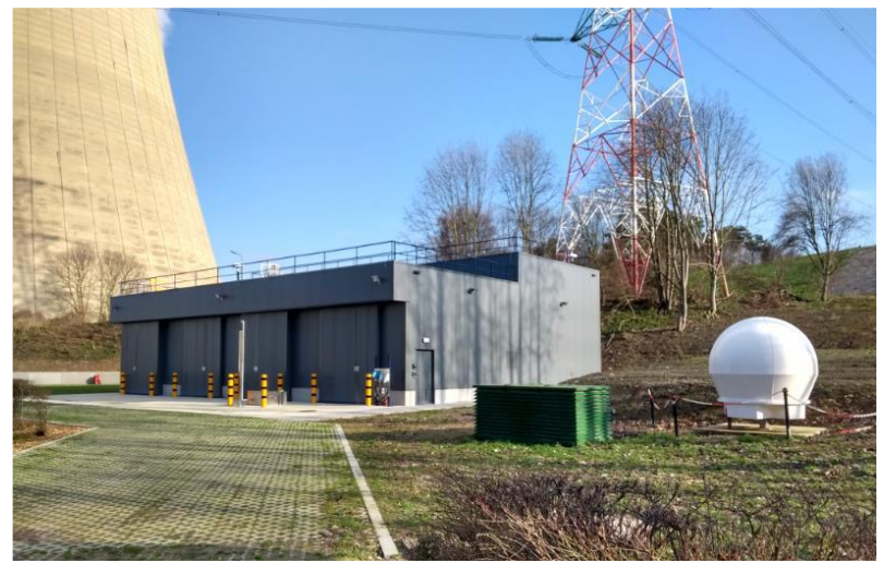
Figure 3 - New annex to site emergency center

Difficulties encountered in recent years had an important impact on the construction schedule of this COS backup building that was finally available by mid-2020, while the mobile COS backup was already available in 2017.