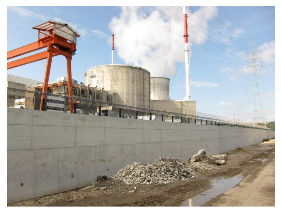
Figure 1 : Peripheral protection of the site of Tihange against beyond-design flooding realized in 2015